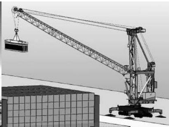
Mobile harbour crane